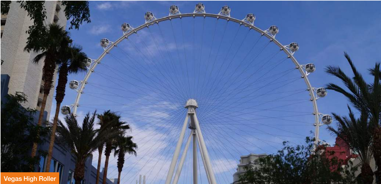
Vegas High Roller